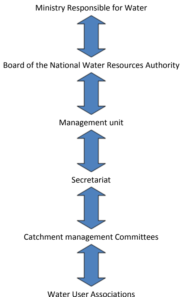
Figure 2: Governance Structure of the National Water Resources Authority